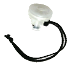
Auxiliary Pump Filter M5-AF-K2 / M5-AF-K100 For high dust environments; available in kits of 5 or 100