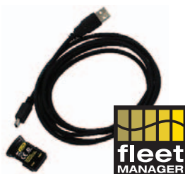
IR Connectivity Kit GA-USB1-IR Use for data download and instrument set-up options