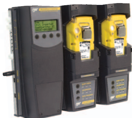
MicroDock II Automatic test and calibration station (see MicroDock II section for additional information)