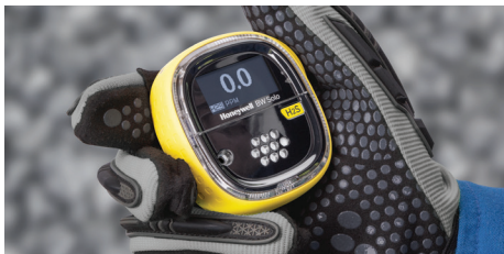
Easy to handle