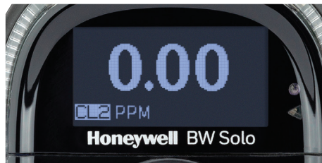
Easy to read